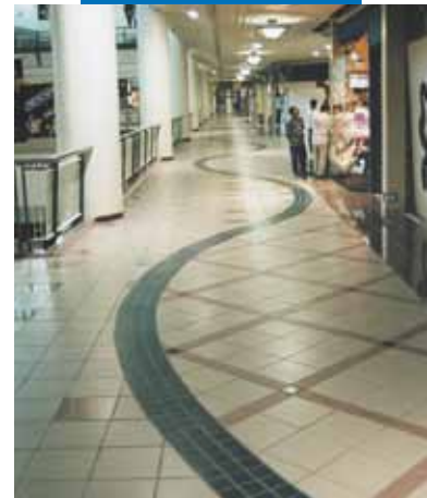
An example of an installation of ceramic tile in a mall - Filinvest Festival Superhall - Manila (Philippines)