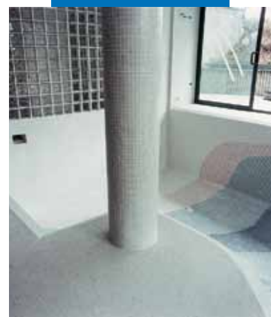
Installation of mosaics