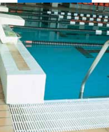
An example of an installation of mosaics with Keracrete + Keracrete Powder in a swimming pool