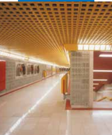
An example of an installation of Granitello in underground - Linea 3 - Milan (Italy)