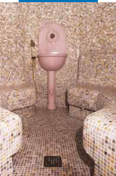
An example of an installation a glass mosaics in a turkish bath - Park Hotel Gritti - Bardolino (Verona), Italy