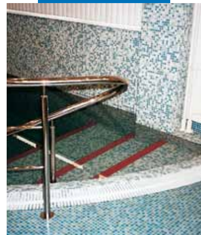
Laying glass mosaics