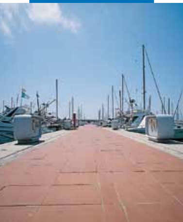
New harbor in Civitavecchia: outdoor installation of terracotta with Keracrete